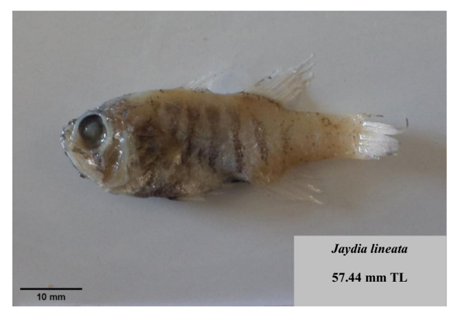
Fig. 4 Jaydia lineata collected from Mangrol fish landing centre, North west coast of India

Species: Jaydia lineata (Temmink & Schlegal, 1842) (Fig. 4)