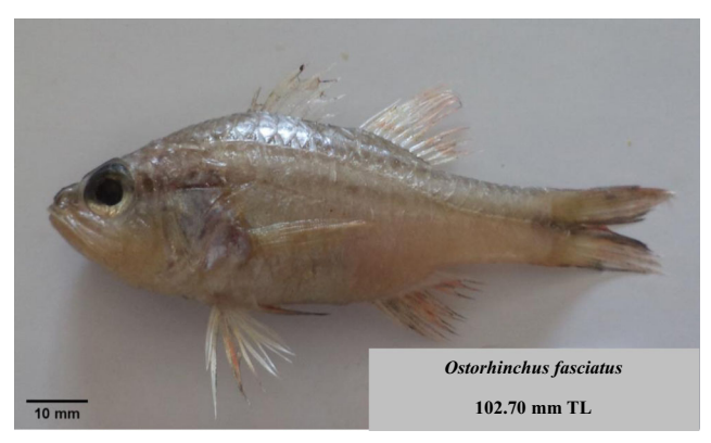
Fig. 5 Ostorhinchus fasciatus collected from Mangrol fish landing centre, North west coast of India

One specimen (57.20 mm TL) and two specimens (57.44 & 58.35 mm TL) collected from trawl bycatch landed at Veraval and Mangrol fish landing centers of Gujarat respectively during October 2017 to September 2018.