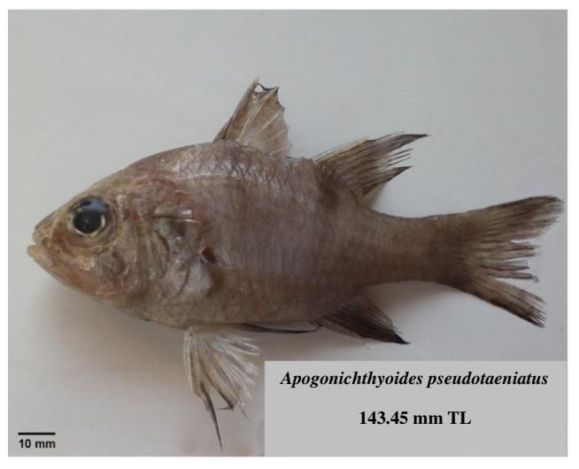
Figure 2 Apogonichthyoides pseudotaeniatus collected from Veraval fish landing centre, North west coast of India

Species: Jaydia queketti (Gilchrist, 1903) (Fig. 3)